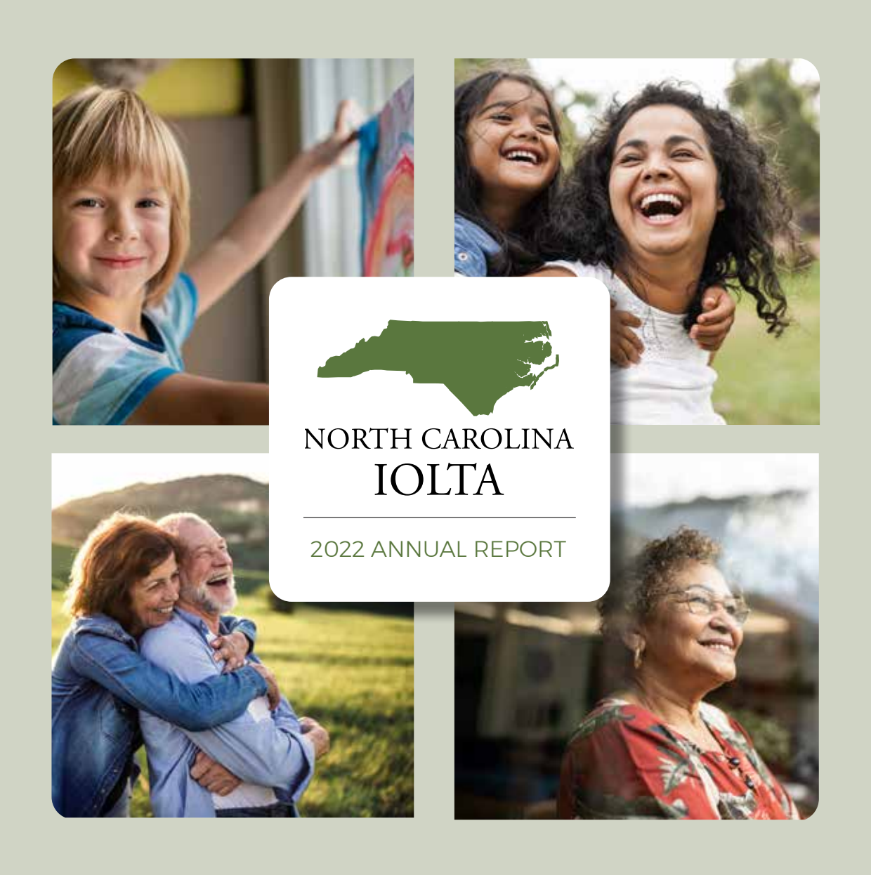
40 years of restoring hope through justice